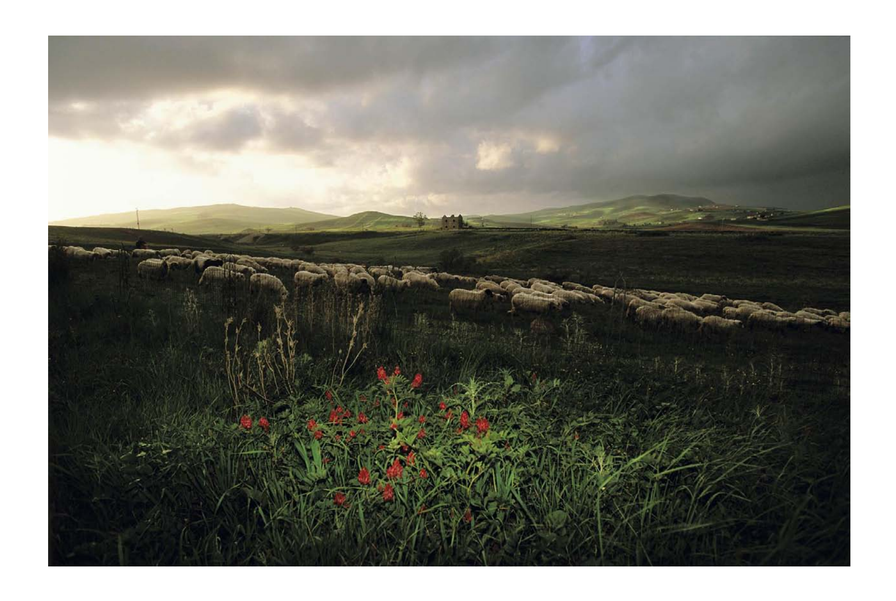
William Albert Allard Image © the artist Courtesy of the artist and Les Yeux du Monde Gallery