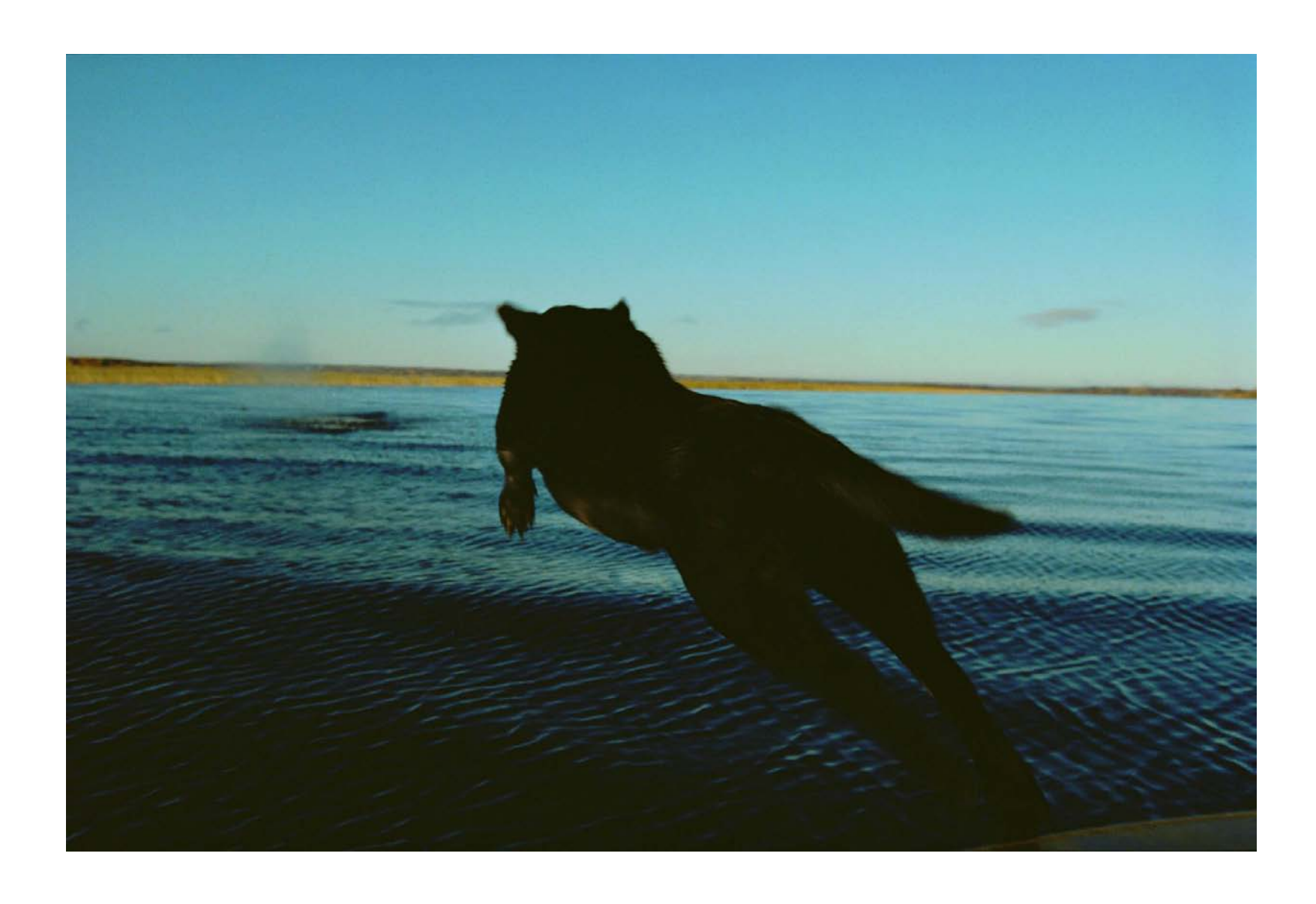
William Albert Allard Image © the artist Courtesy of the artist and Les Yeux du Monde Gallery