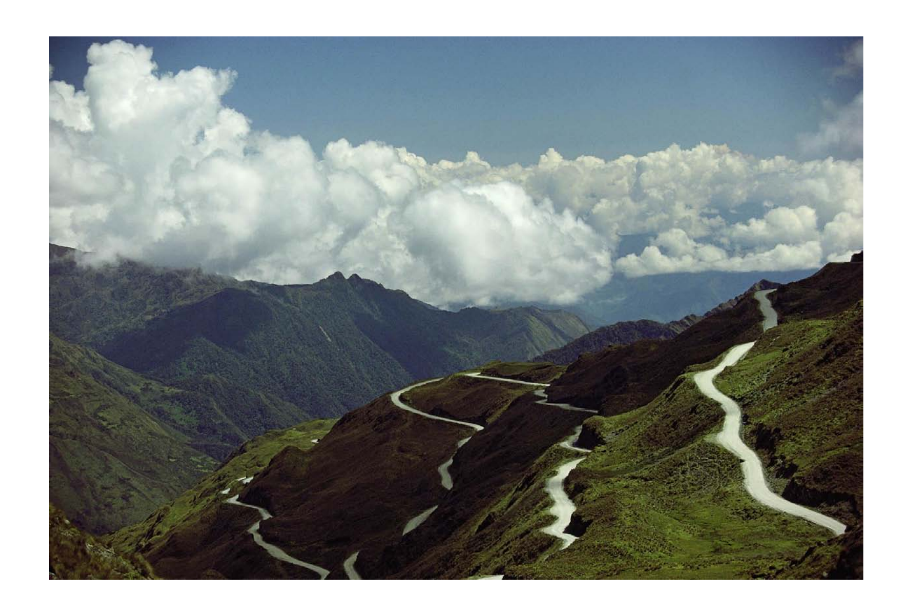
William Albert Allard Image © the artist Courtesy of the artist and Les Yeux du Monde Gallery