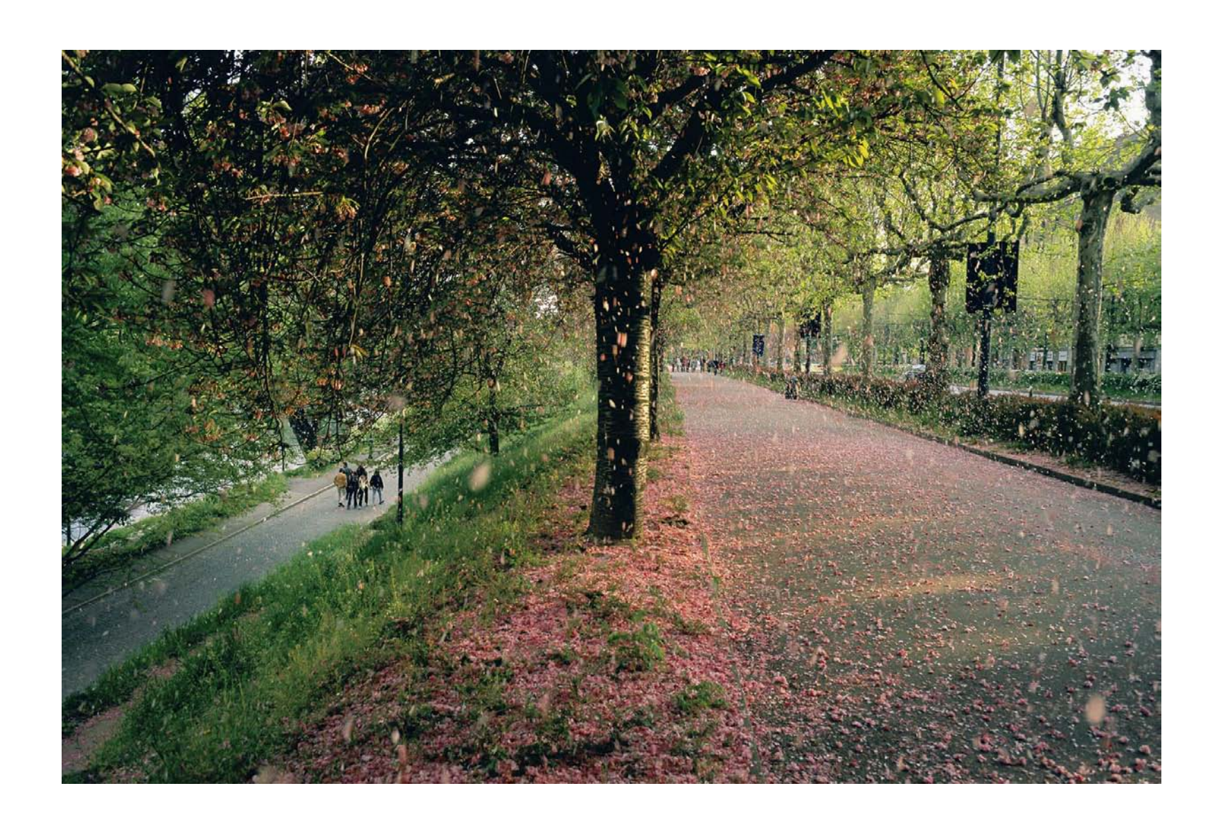
William Albert Allard Image © the artist Courtesy of the artist and Les Yeux du Monde Gallery