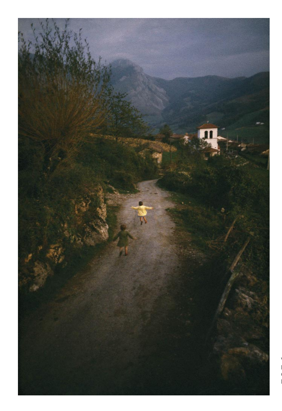
William Albert Allard Image © the artist Courtesy of the artist and Les Yeux du Monde Gallery