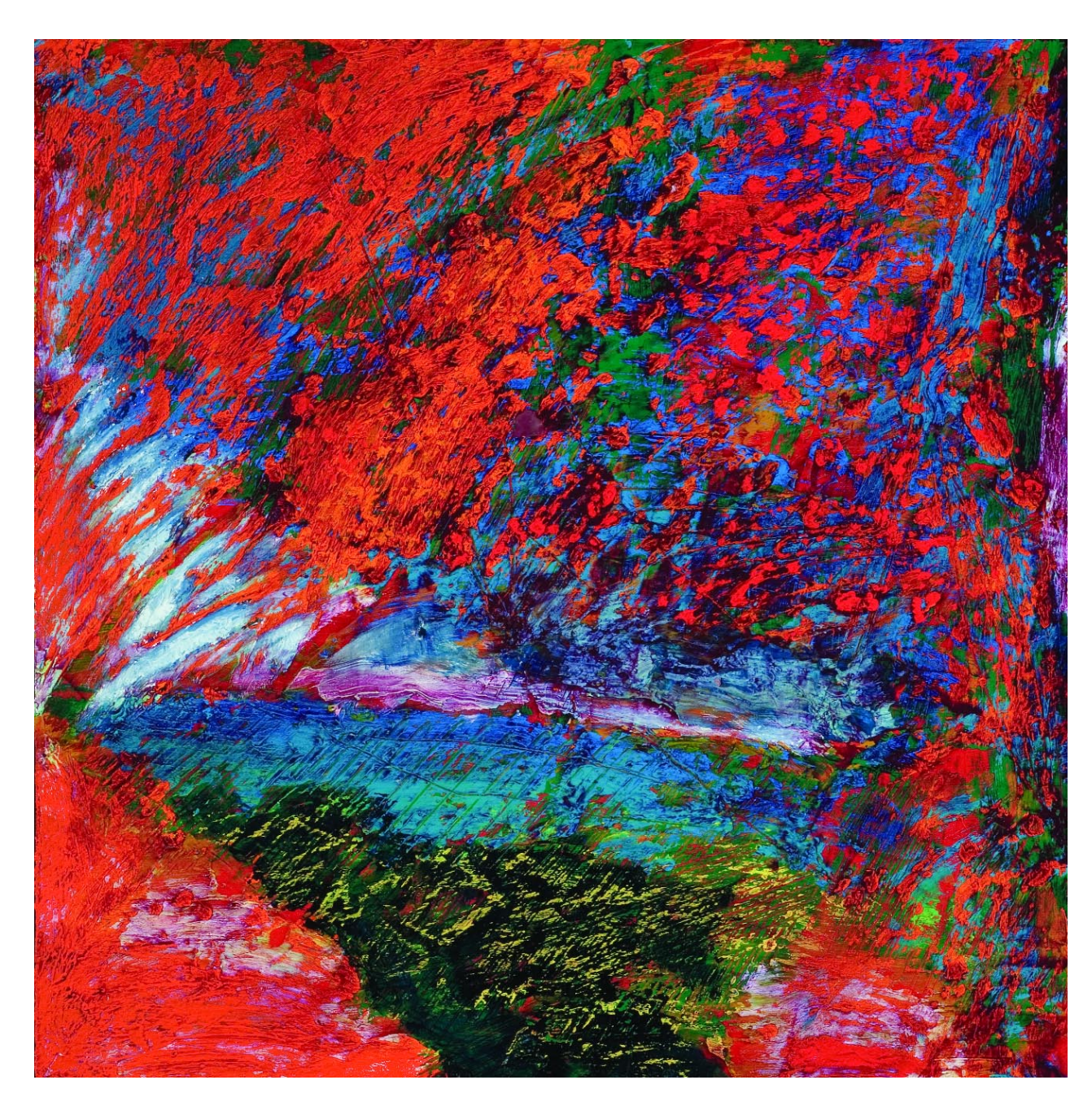
Herb Jackson River of Rubies, 2006. Oil on birch panel. 12 x 12"