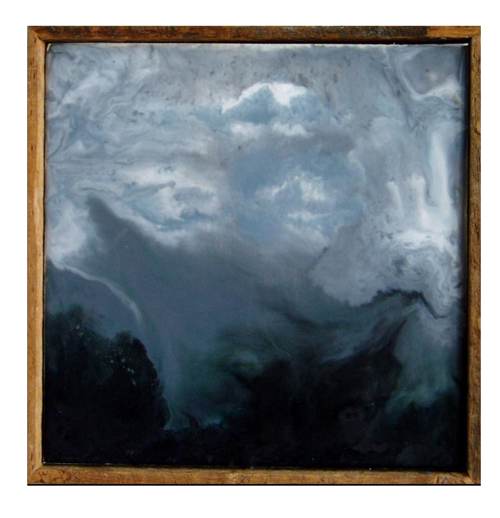
Taliaferro Logan Seascape Encaustic, 10 × 10 inches.