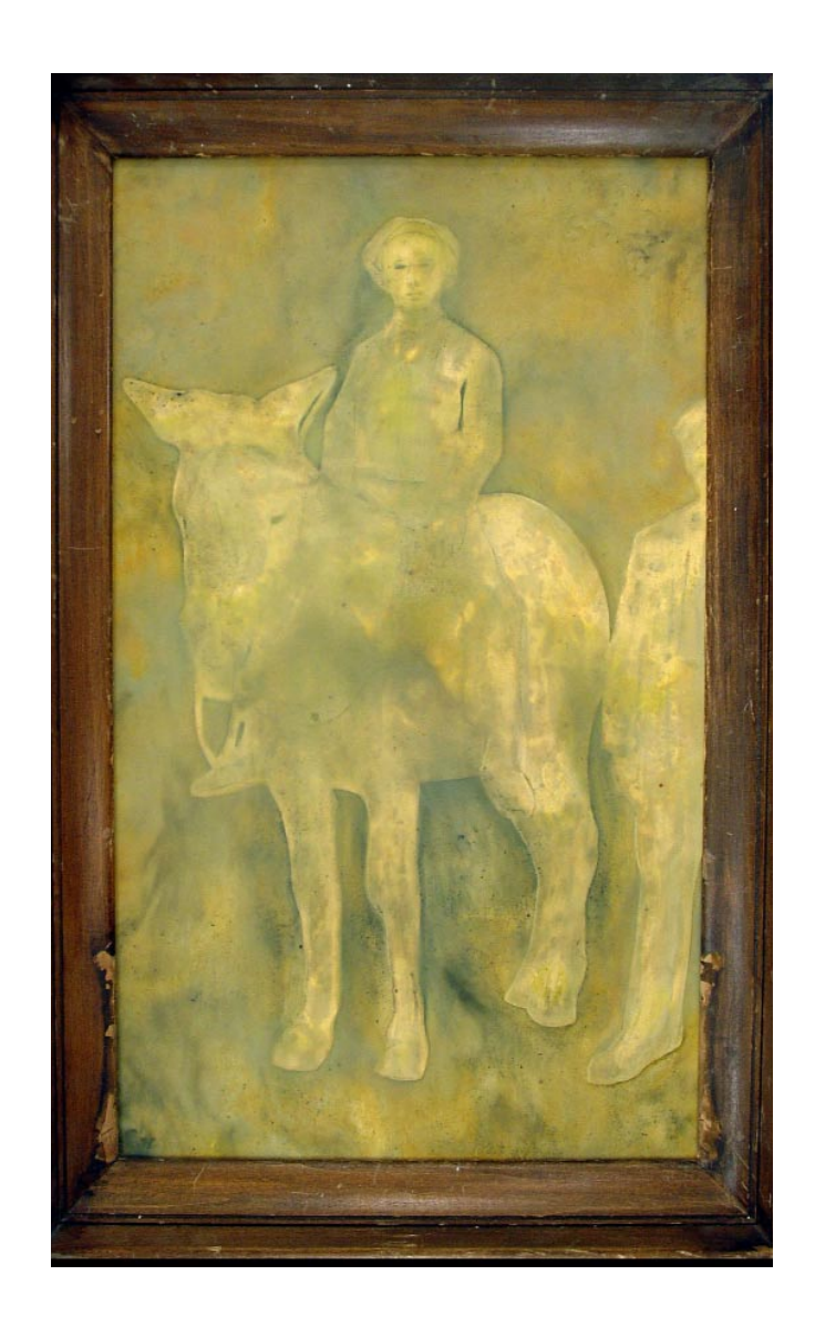
Taliaferro Logan Bidgie Donkey Encaustic, 30 × 18 inches