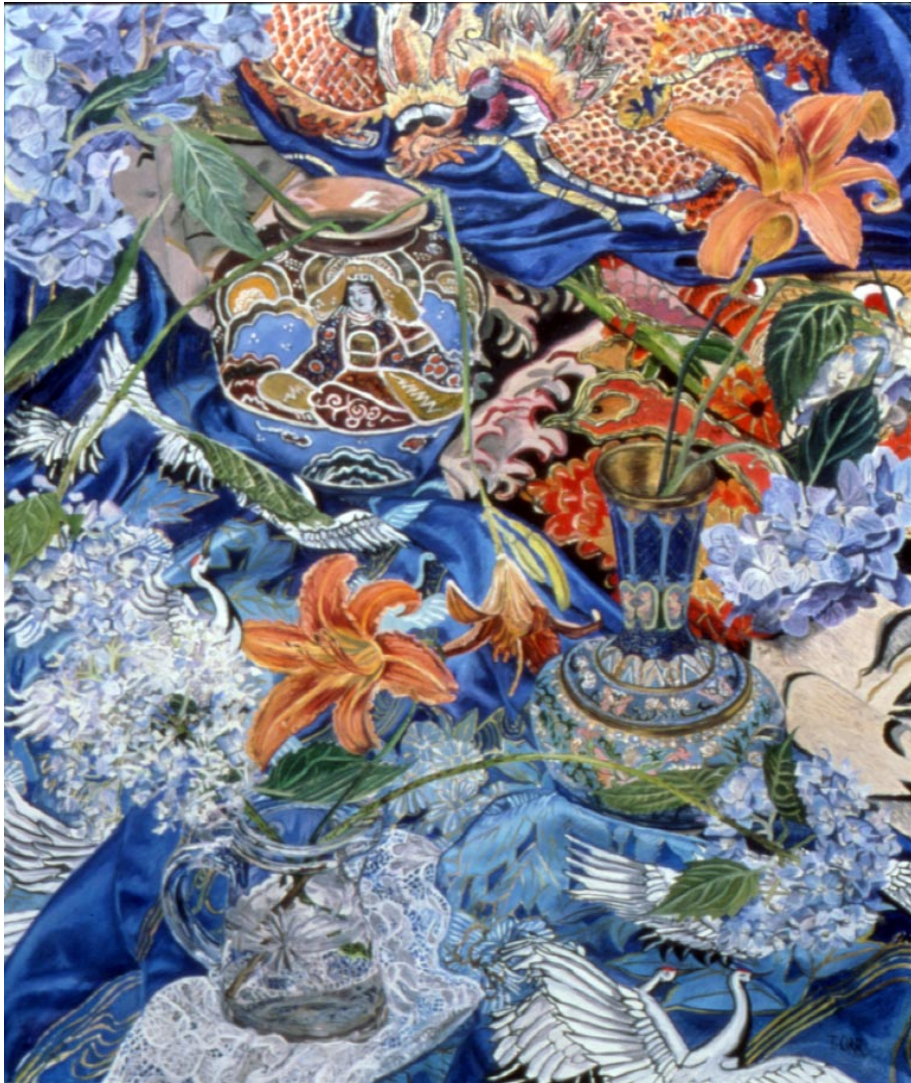
Trisha Orr Images © the artist Courtesy of the artist and Les Yeux du Monde Gallery