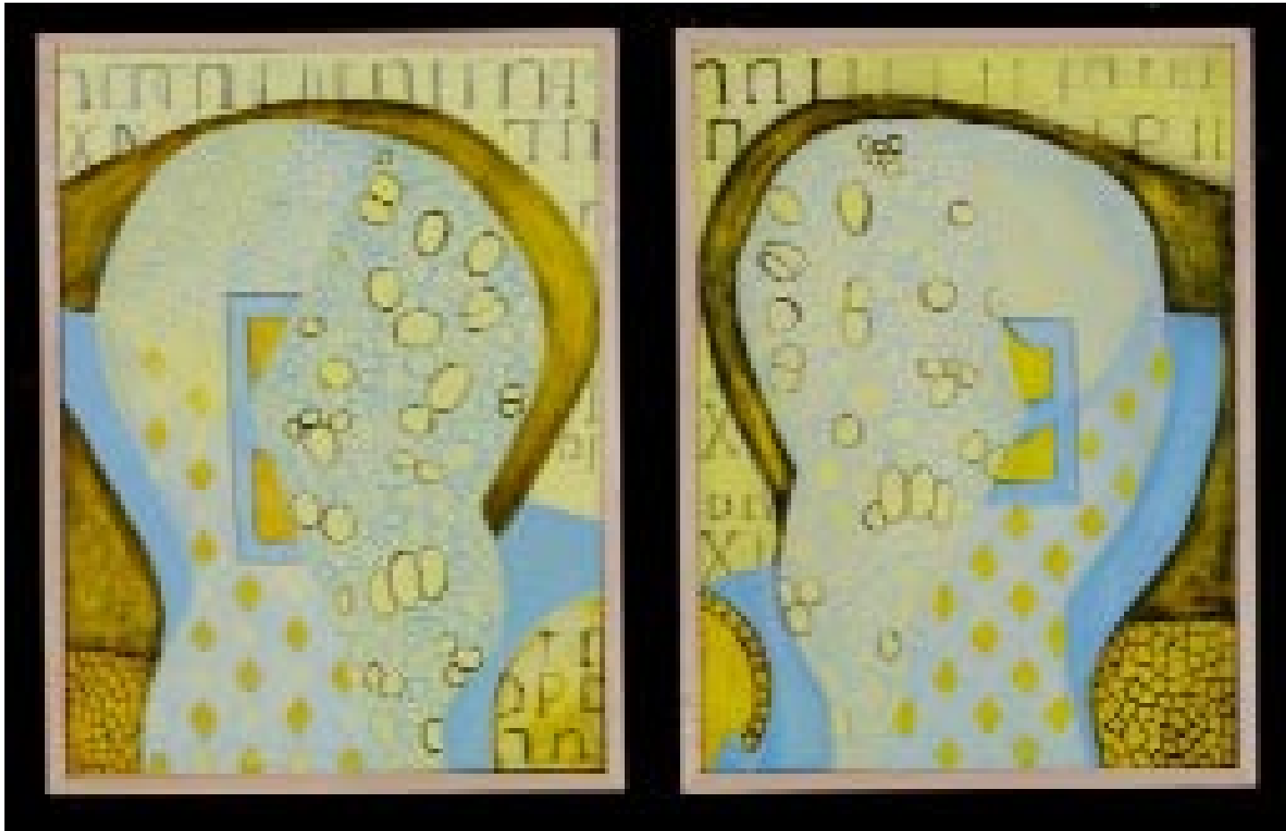
Esmé Thompson Pensa , 2006. Diptych, acrylic on board, two 9 x 12 inches panels