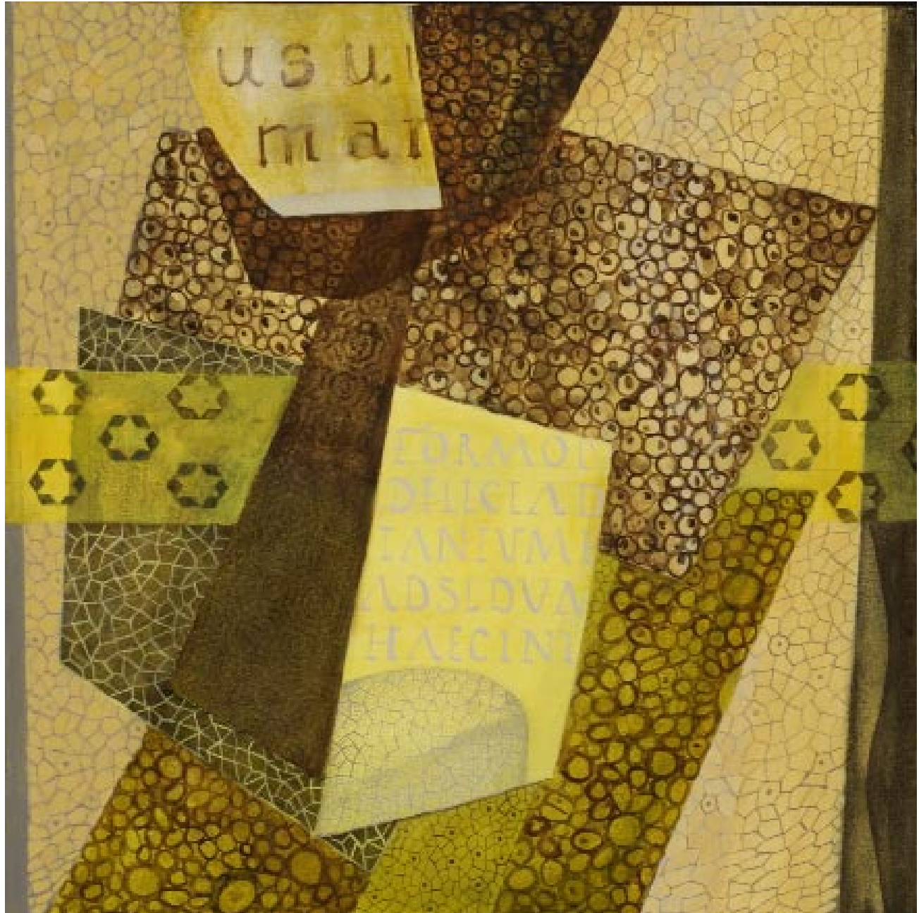
Esmé Thompson Tessere III , 2005. Acrylic on canvas, 22 x 22 inches