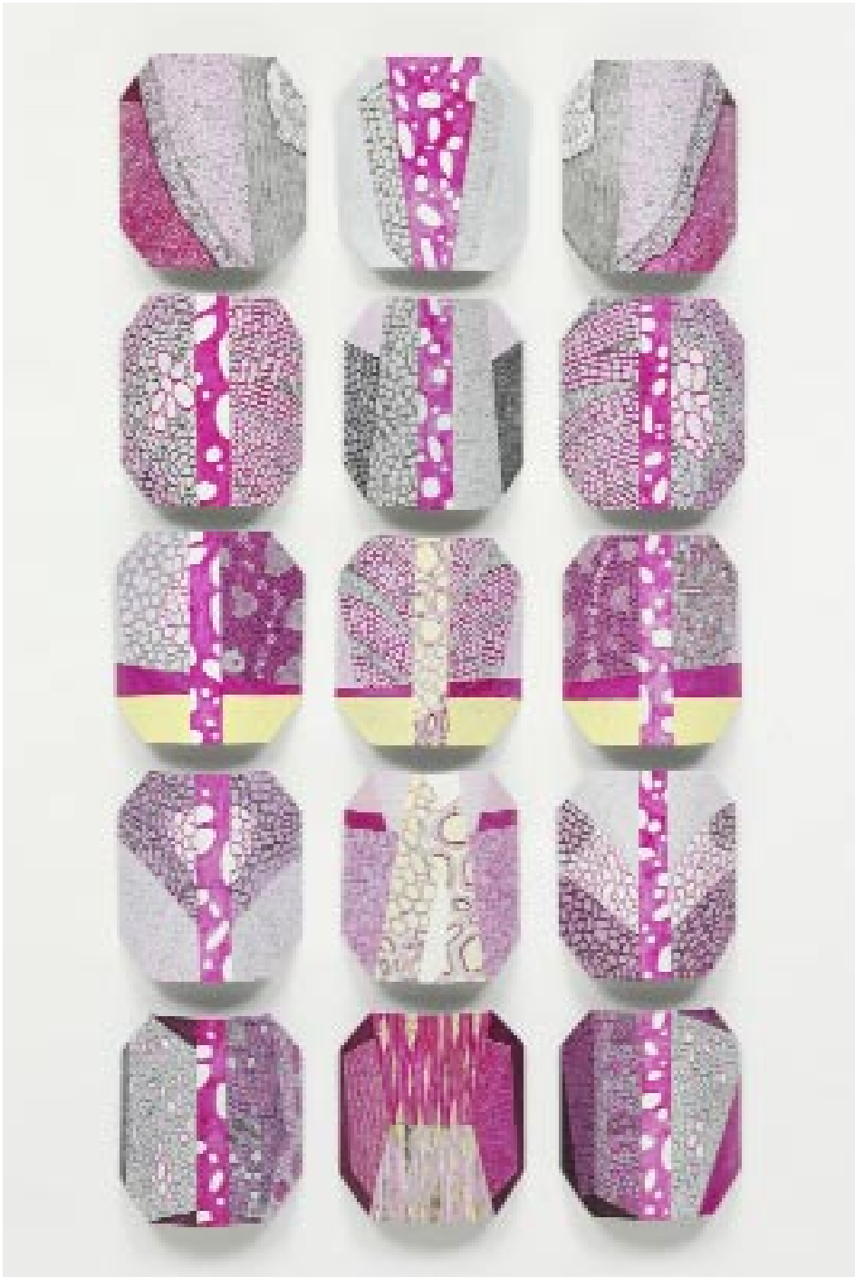
Esmé Thompson Ornamentum V , 2005. Right side; acrylic on metal; fifteen panels, 12 x 12 inches