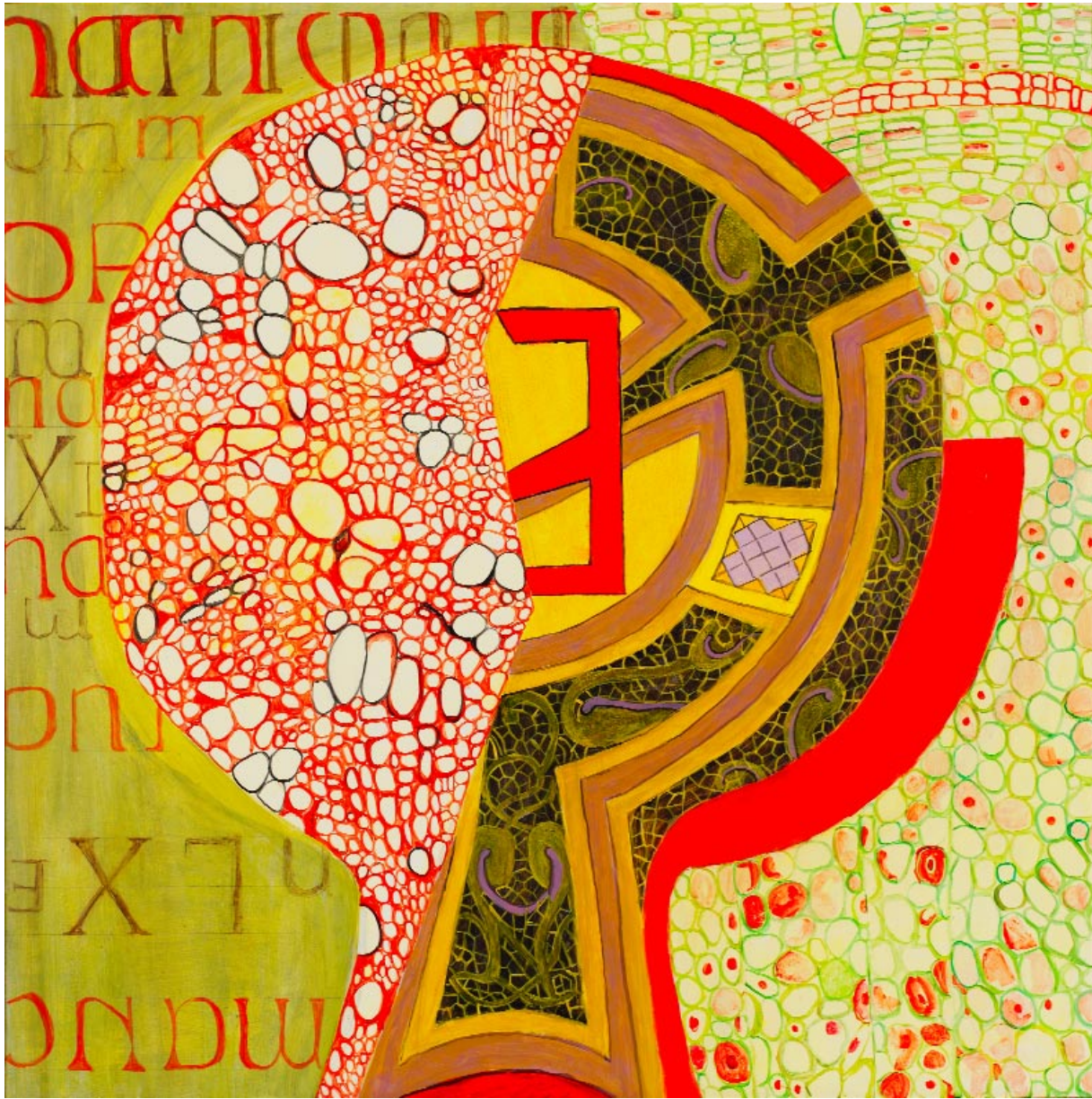
Esmé Thompson Credo , 2005. Acrylic on board, 24 x 24 inches