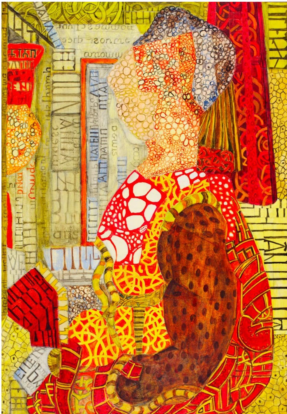
Esmé Thompson Ritratto , 2006. Acrylic on board, 22 x 15 inches